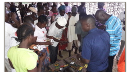
Once again people excited to get glasses. Their joy was such a blessing!