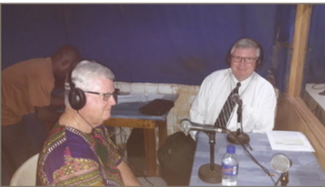
On radio station in Tappita