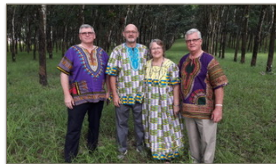
Visiting Firestone Rubber Trees